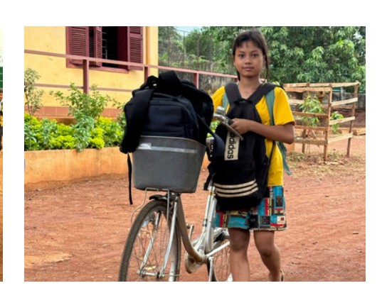
Ready for meals